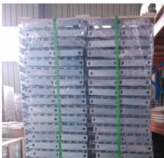
2. Suitable carton size