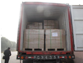
5. Professional shock