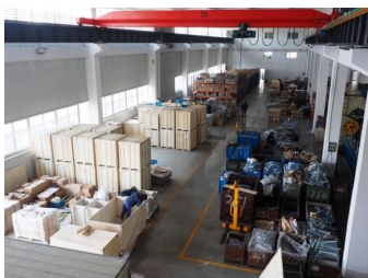
4. Professional placement